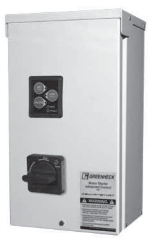
NEMA 3R 16ga. Steel Enclosure