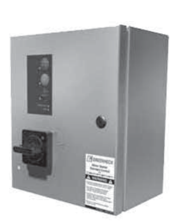
NEMA 4X 304 Stainless Steel Enclosure

Please read and save these instructions for future reference. Read carefully before attempting to assemble, install, operate or maintain the product described. Protect yourself and others by observing all safety information. Failure to comply with instructions could result in personal injury and/or property damage!