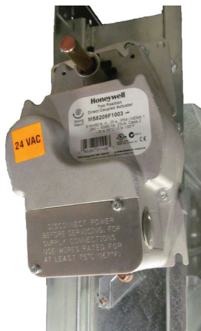
Electric External Mount Actuator

Currently, most control damper applications use electric actuators. They are available in a variety of drive configurations, however, the HVAC industry has standardized direct-coupled models because of the ease of installation and interchangeability. Electric actuators are available with supply voltages of 24 VAC, 24 VDC, 120 VAC, and 240 VAC. Each is designed for single-phase power. A transformer may be used to reduce high voltage systems (277, 460/480, and 575V) to meet actuator voltage.