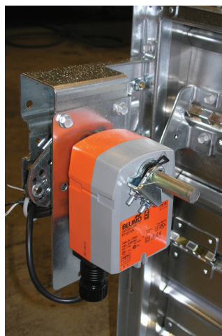
Electric Internal Mount Actuator

Pneumatic actuators are linear output devices that require instrument air (clean and dry air) for actuation and a linkage system to convert their linear motion to the rotary motion required for damper operation. They are provided with spring return operation, which returns the actuator's linear shaft to a fixed position when air pressure is removed. Pneumatic actuators are simple, reliable, and relatively inexpensive.