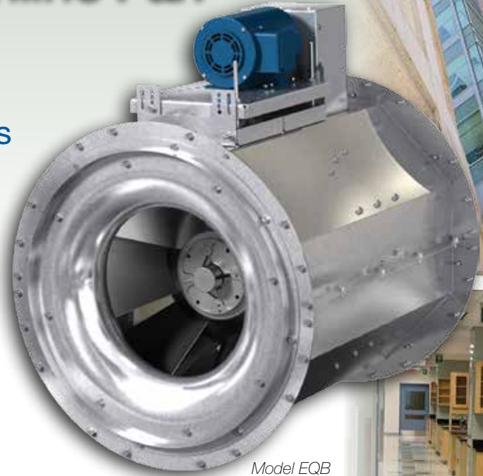
Model EQB (Patent Pending)

Mixed flow fans are hybrid designs that combine the best axial and centrifugal properties into one fan. The new model EQB offers better air and sound performance than axial and centrifugal inline fans and is priced to fill a gap in the current market offering of inline fans.