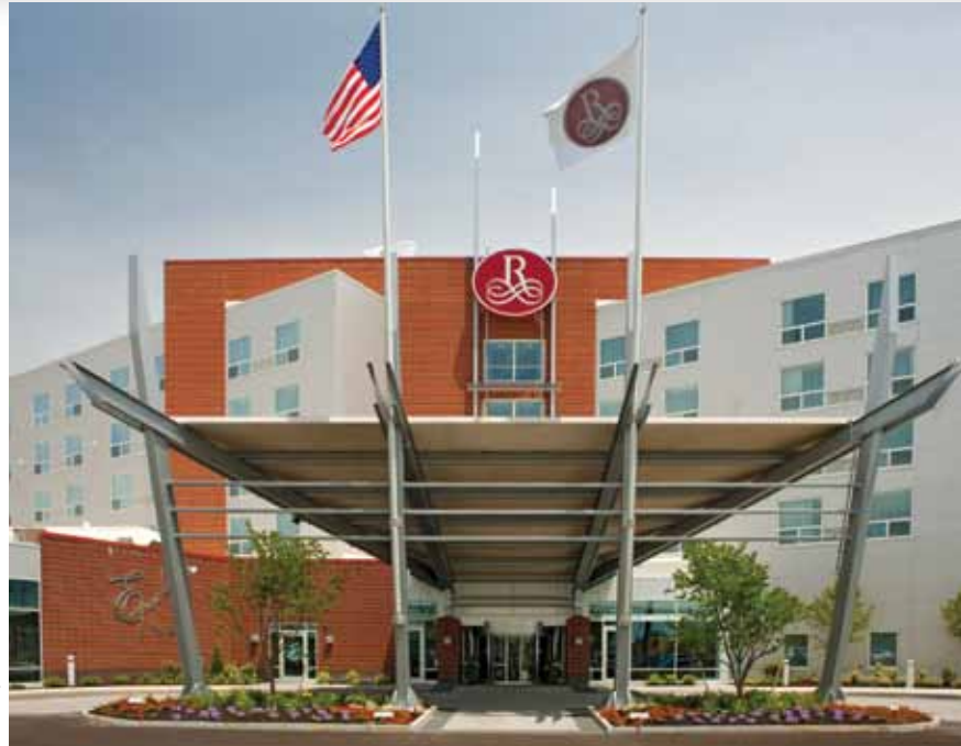
Renaissance Boston Hotel & Spa at Patriot Place in Foxborough, MA