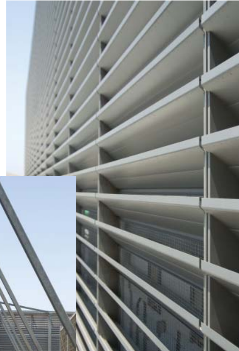
Above: Greenheck's inverted blade louver with recessed mullions.

Fifteen smaller 4-inch louvers were designed and manufactured for the base of the building to allow airflow into the mechanical rooms. Some of these louvers included hinges and locks to allow easy, but secured, access to the mechanical equipment.