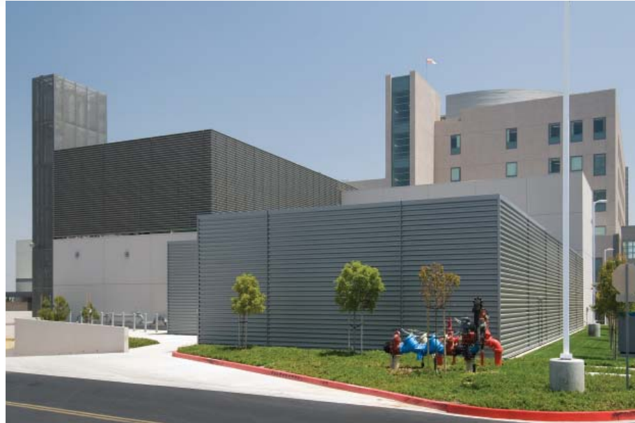
Kaiser Permanente Orange County Irvine Medical Center's 28,000 square foot utility plant in Irvine, CA.

Specialty Building Components Pico Rivera, CA