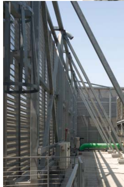
Left: Interior view of the installed 92-foot louver.