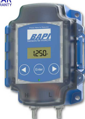
Touch Pressure Sensor