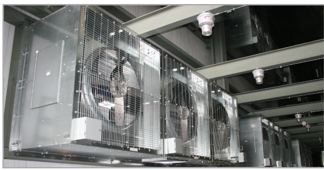
Greenheck's custom-designed special direct drive "Utility Duty" propeller fans in a 90" x 90" wall housing

exhaust the required air volume and to maintain acceptable indoor air quality and temperatures. The ventilation equipment must be capable of withstanding industrial level building vibrations, and have low maintenance requirements.