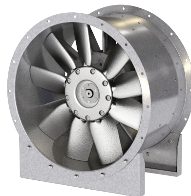
Greenheck Axial Fan Model RA

The AMCA CRP test standards are shown under Test Standards in this document. A specifying engineer or consultant may choose to reference both the publication and the test standard in order to increase their confidence that the product is AMCA certified.