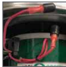
Figure 2 208-230/277V Operation