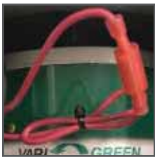
Figure 1 115V Operation

When the jumper wire is disconnected and capped , the motor operates at 208-230/277V, see Figure 2.