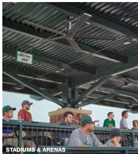
STADIUMS & ARENAS