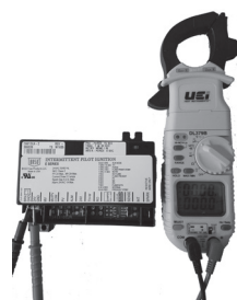
Fig. 3 BASO Ignition Control

Remove cap to access maximum firing rate adjustment