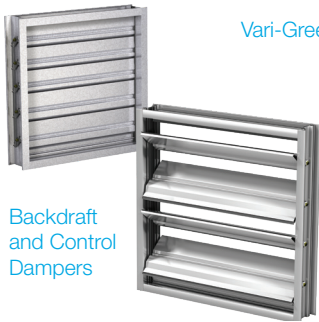
Backdraft and Control Dampers