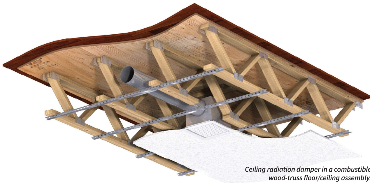
Ceiling radiation damper in a combustible wood-truss floor/ceiling assembly.

A look at the role of floor/ceiling- or roof/ceiling-assembly design and construction in proper ceiling-radiation-damper applications.