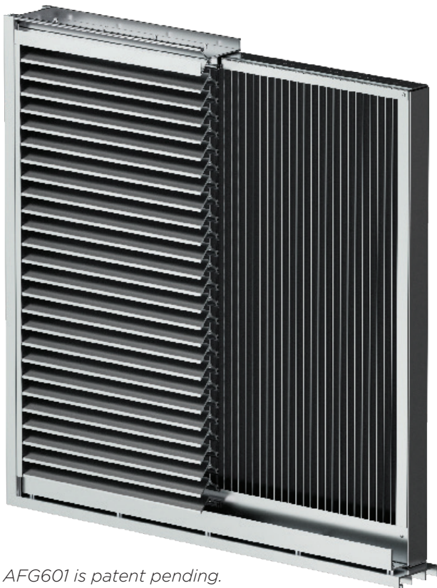
AFG601 is patent pending.

Select competitors offer FEMA 361 louvers with certified wind-driven performance. However, none of them offer exceptional wind-driven rain performance. Our newly developed AFG601 is ideally suited for FEMA tornado safe rooms and storm shelters. The AFG601 has superior free area and AMCA 500-L Wind-Driven Rain performance to competitor-like products while also being the only product in its class to have the AMCA 550 High-Velocity Wind-Driven Rain Listing, making it suitable for tornado safe room and storm shelter applications in the Hurricane-Prone Region or any location where maximum protection against wind-driven rain is preferred.